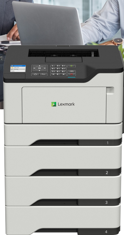
M1246 with optional trays